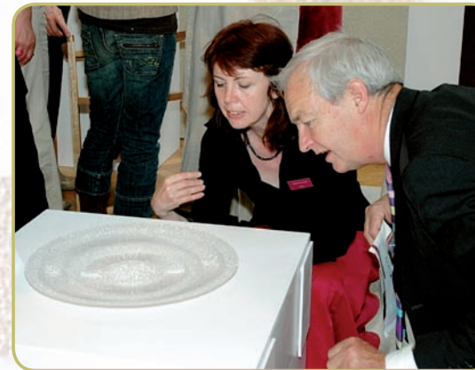
Winner of the Wesley-Barrell Craft Award with panel judge Jon Snow

enjoyed working with colour and light on a large scale and I am very excited about developing coloured glass for interior settings as the possibilities are limitless.'